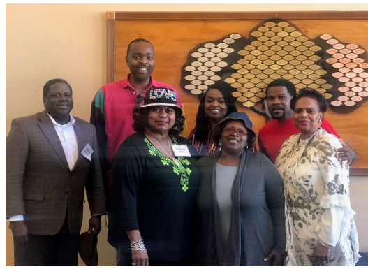
2018 God's Love Bank Institute Workshop Attendees

REACHING THE LOST RETAINING THE SAVED REJOICING IN AND MAGNIFYING THE LORD